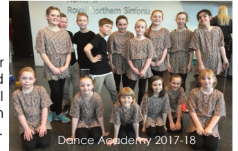
Dance Academy 2017-18

classes for selected children will then start in September.