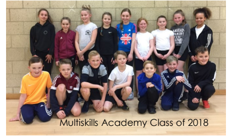
Multiskills Academy Class of 2018

programmes, to help them in whatever their chosen sport might be.